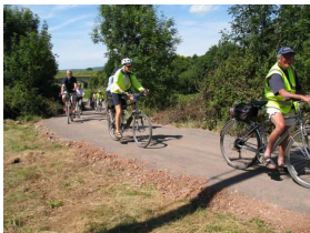
Opening of Flax Bourton Greenway 11 th August 2007

The UK's sustainable transport charity Sustrans is joining up the dots between communities and local amenities with its groundbreaking new Connect2 programme