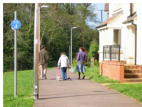
Route through Long Ashton

The Nailsea-Bristol route is one of these projects. It will make key links and connections for people living in Bristol, Long Ashton, Nailsea and Backwell. The scheme joins already completed sections in Long Ashton and Flax Bourton and will offer attractive new routes to Tyntesfield for National Trust visitors and to Nailsea, Backwell and Ashton Park Schools for staff and students.